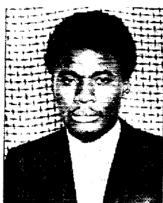
Ubushakashatsi bwa Kangura Ubu hagomye imbaraga z'abanyarwanda bose