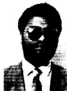
Birashoboka ko aba ba Minisitiri bazasigara muri Guverinoma y'Inzibacyuho.