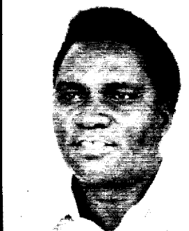
Hagomye Politiki ya HABYARIMANA