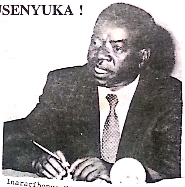
Inararibonye NGRUMPATSE Matweze niwe Abarwanashya ka ba MRND bemeza ko aliwe ushobora kuzegukana umwanya wa Président wa M.R.N.D.